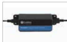
AI-1000 Signal Conditioner