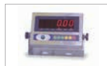
RD-1000 Resistive Load Cell Display