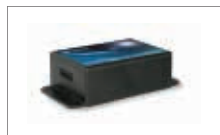
DI-100U/DI-1000U Digital Load Cell Interface