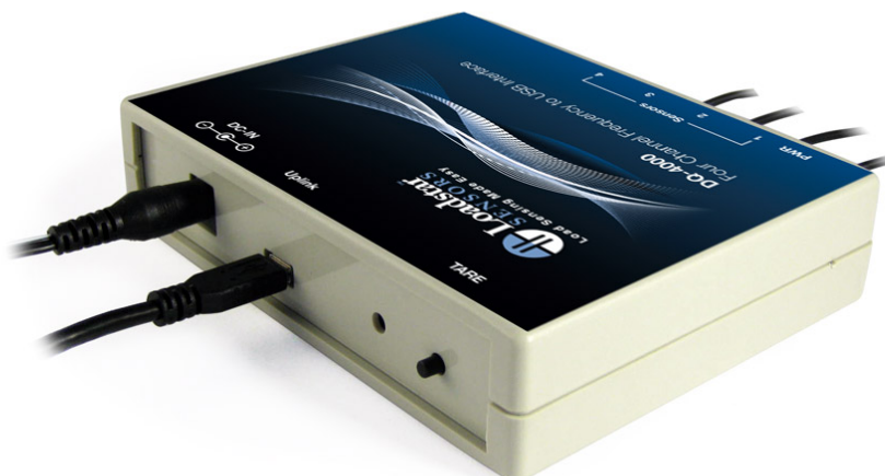
Figure 2: Rear View – With DC-IN and USB Uplink attached

The rear view below shows the power input, the USB uplink to the host PC, access to contrast adjustment for the optional LCD, and a pushbutton to scroll through the LCD or to tare the load.