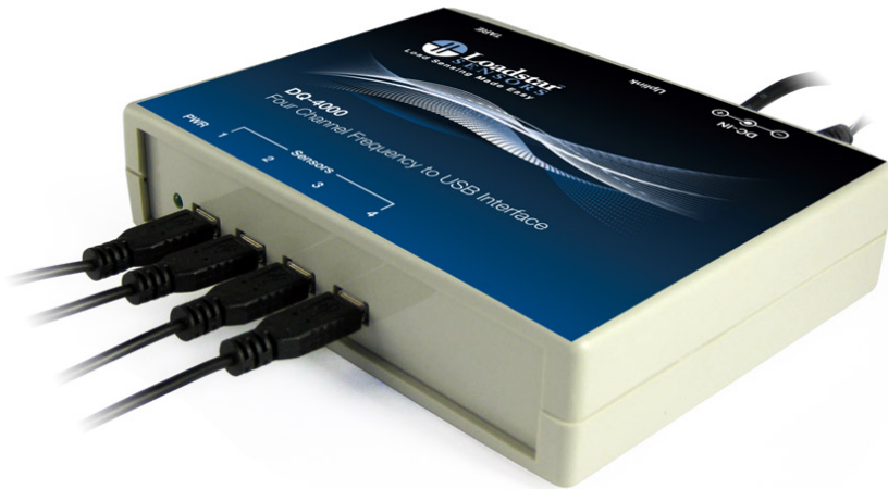
Figure 1: Front View – With Sensors Attached

The front view below shows 4 USB Type-B input connections for the iLoad frequency-based sensors.