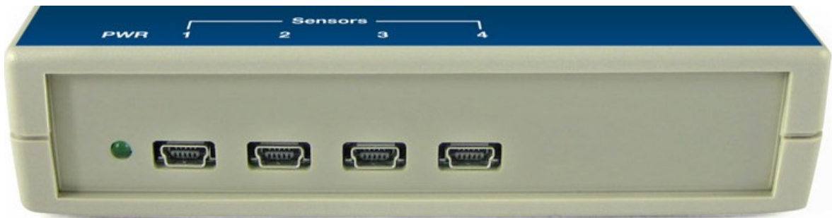
Figure 5: Front View – Sensor Input Ports

The picture below shows the front view of the DQ-4000. If you ordered with only one load cell, plug it in Sensor 1 port. If you ordered multiple load cells, plug them per the serial numbers and the markings on the cable.