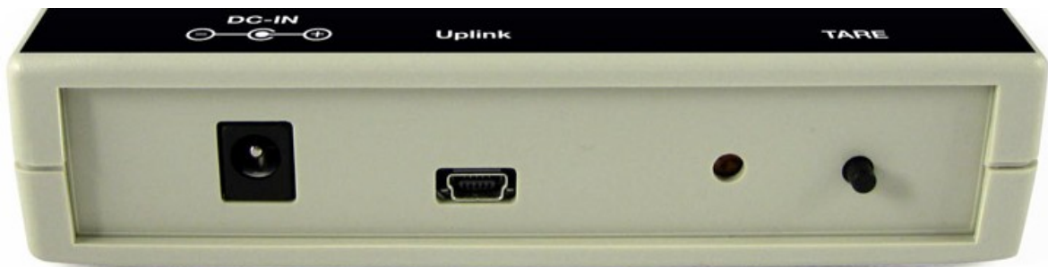
Figure 6: Back View – DC-IN, USB Uplink, LCD Contrast & Pushbutton

The LCD contrast adjustment access and the pushbutton are applicable only when the DQ-4000 is equipped with the LCD option.